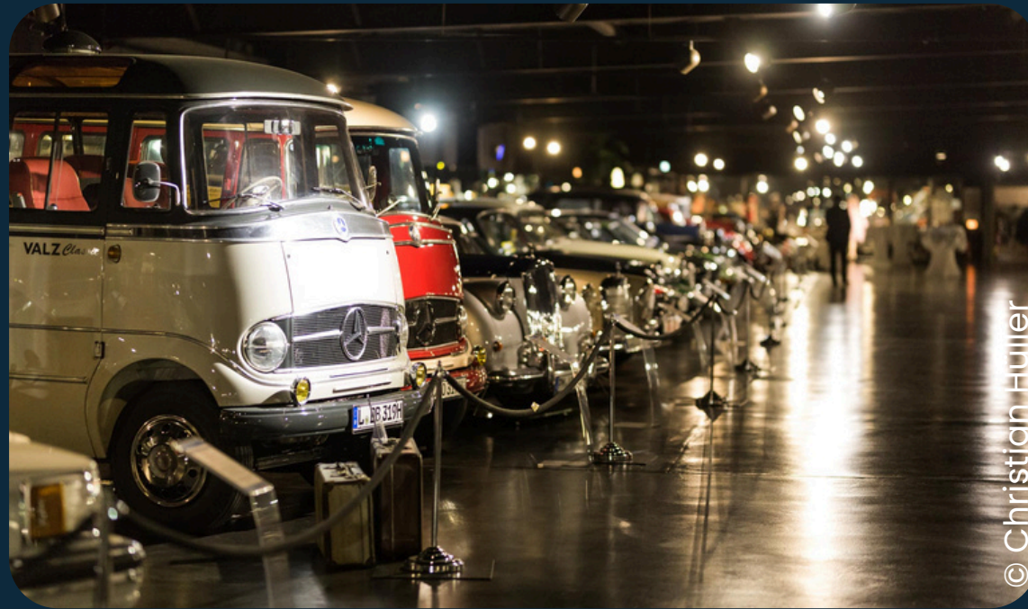
Da Capo Oldtimermuseum & Eventhalle