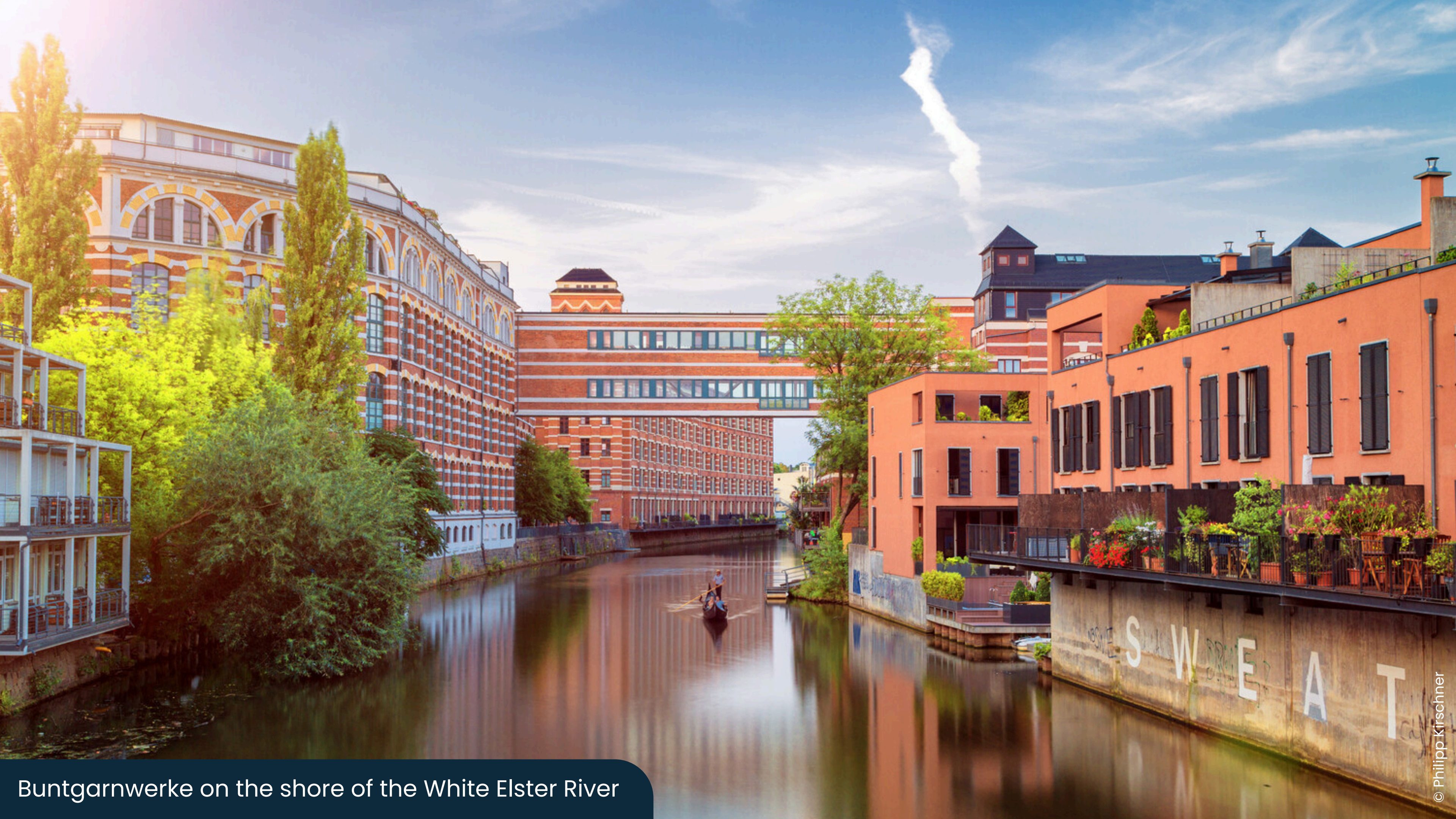
Buntgarnwerke on the shore of the White Elster River