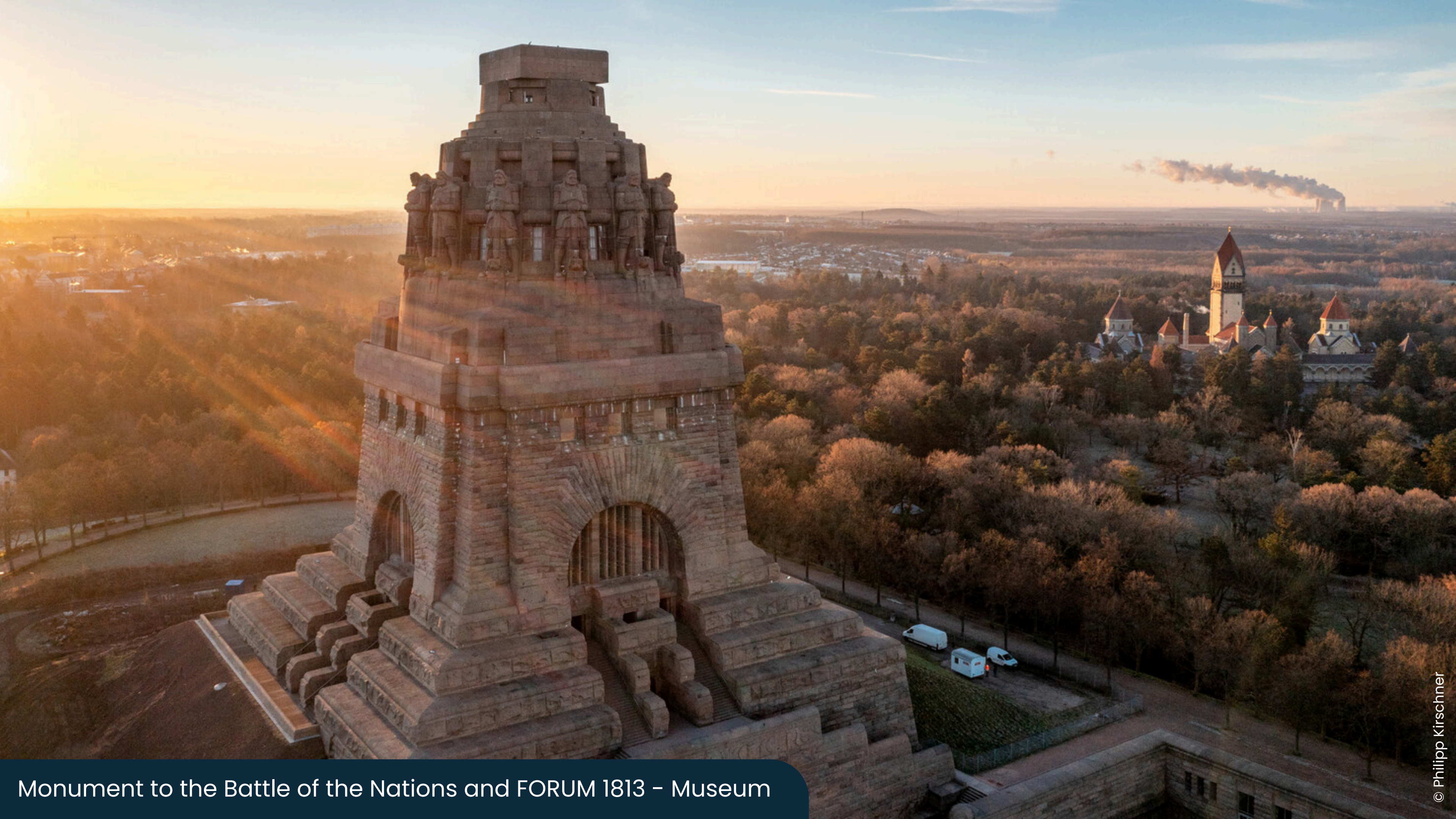
Monument to the Battle of the Nations and FORUM 1813 – Museum