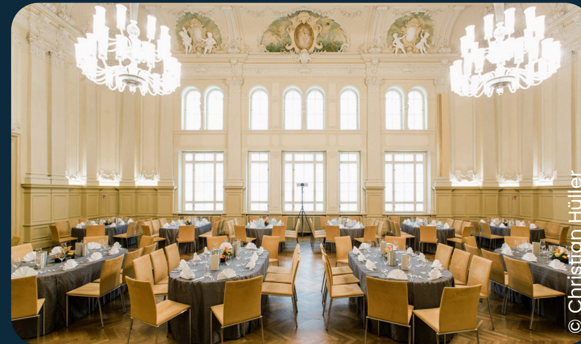
Salles de Pologne