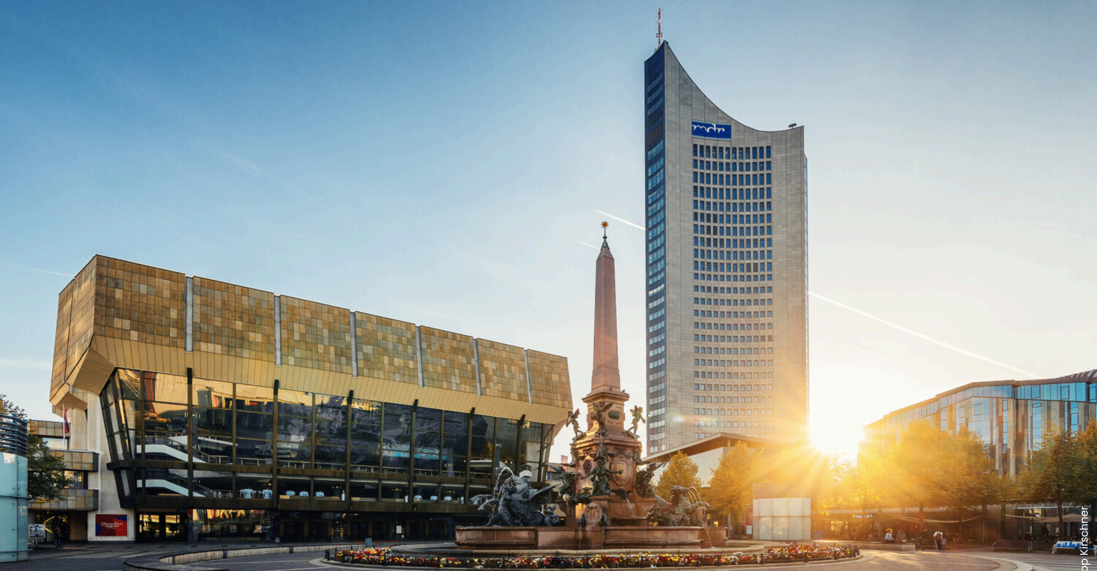
Augustusplatz square with Leipzig Gewandhaus concert hall and City High-rise with Panorama Tower restaurant